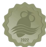
Epulæ 2022 Anfora Platino