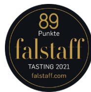
Falstaff Spirits Special 2021 89 Punkte