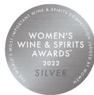
WWSA 2022 Silver Medal