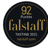
Falstaff Spirits Special 2021 92 Punkte