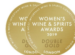
WWSA 2019 Double Gold Medal