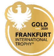
FI Trophy® 2020 Gold Medal