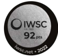
IWSC 2022 Spirit Silver