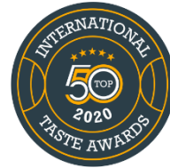
International Taste Award 2020 Top50