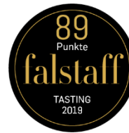
Falstaff 2019 89 Punkte