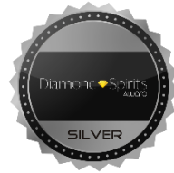
Diamond Spirits Award 2019 Silver Medal